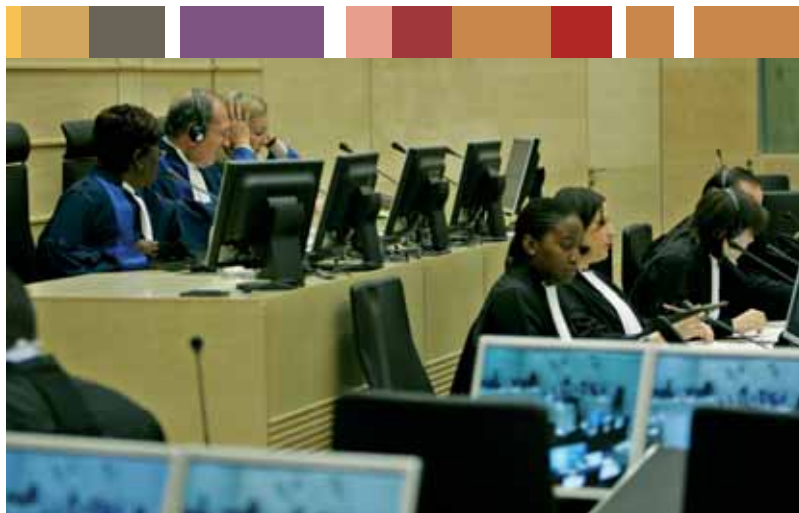
Pre-Trial Judges conducting a hearing