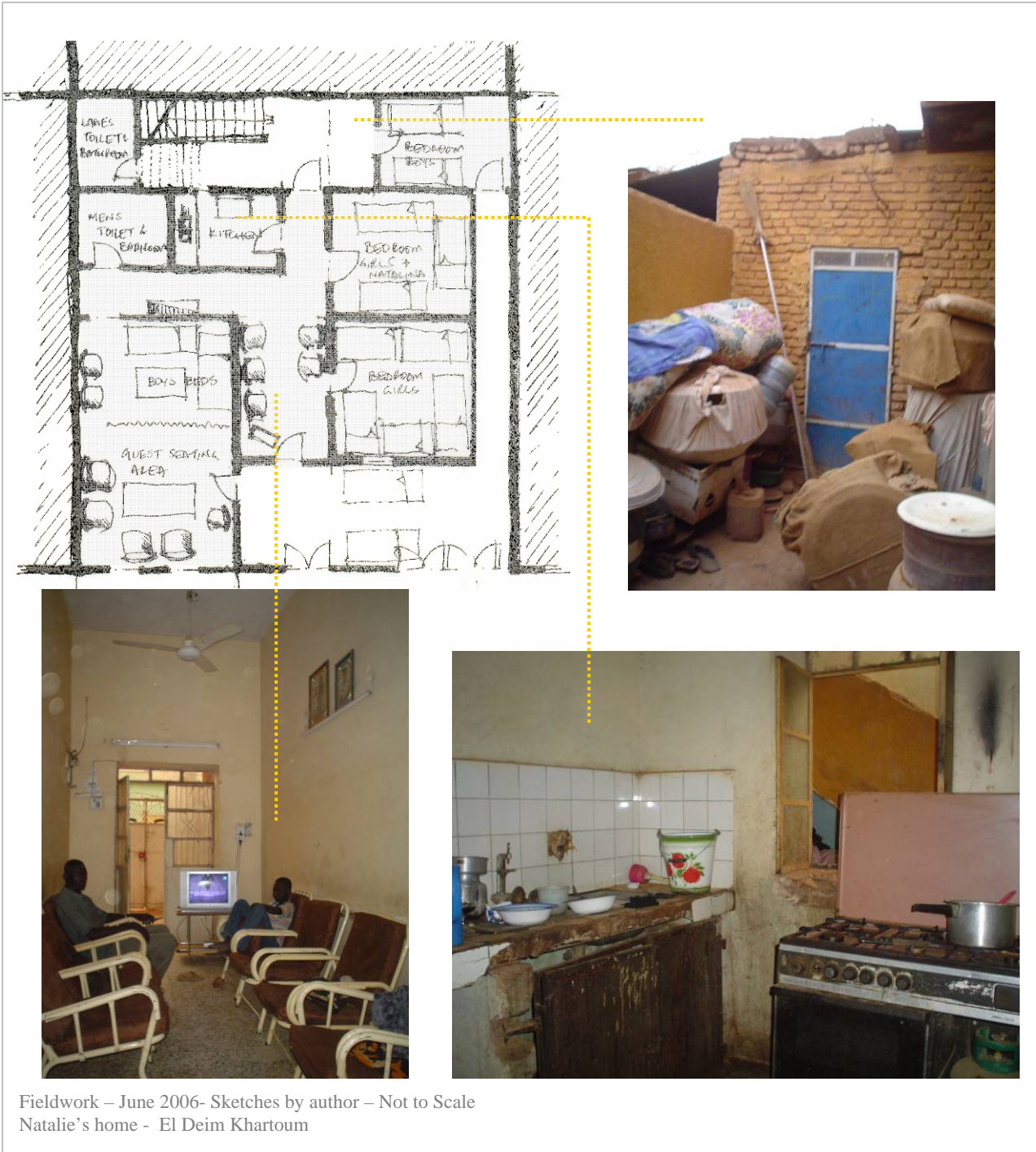
Fieldwork – June 2006- Sketches by author – Not to Scale Natalie’s home - El Deim Khartoum

the connotation of the hospital ward is even stronger than that of the hotel and station; the hospital ward is a temporary abode that one does not visit or use with free will, it is a space that needs to be used due to circumstances of illness, weakness and vulnerability. The ‘home’, therefore in the mind of Moris becomes a forced temporary abode, a place of weakness.