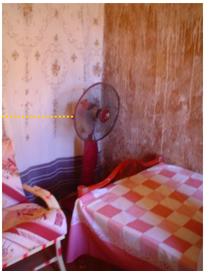
Dark red electrical fan to match with the furniture and the bed sheets, the paradox is that the neighbourhood has never had an been supplied electricity and there is little of that in the near future