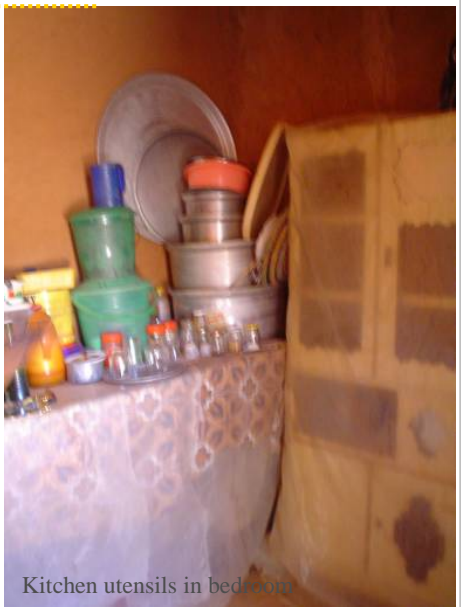
Kitchen utensils in bedroom